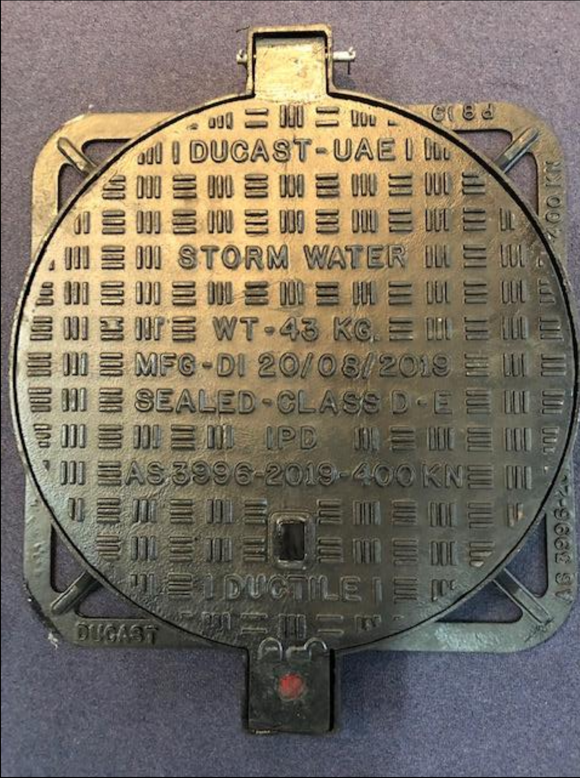
HINGED TYPE COVER