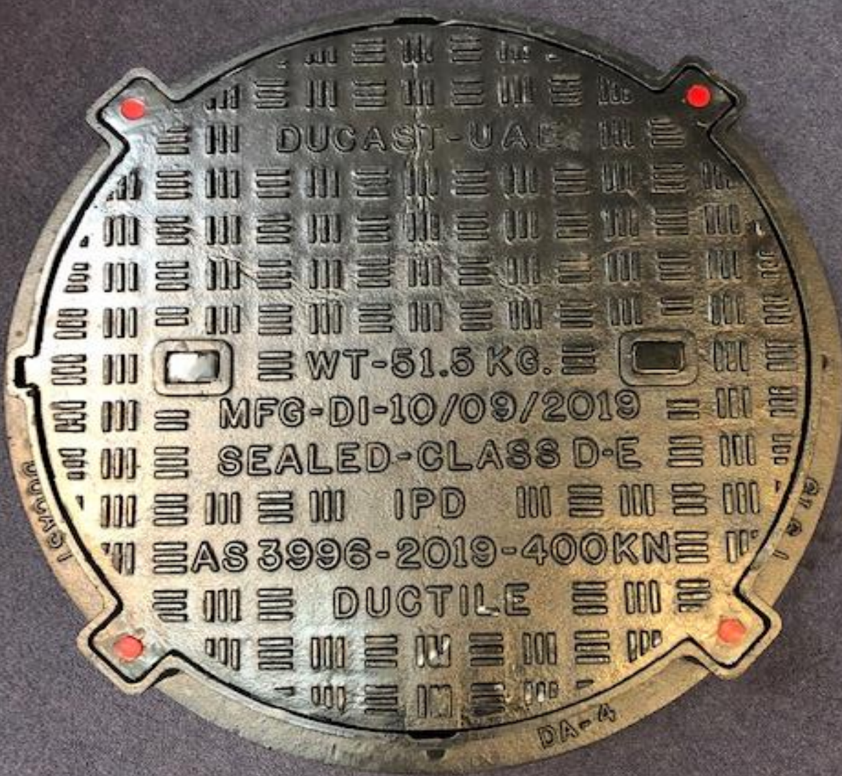
CIRCULAR TYPE COVER